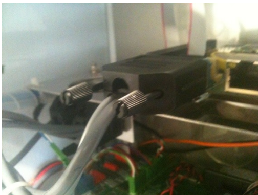
The Pinpad Cable position on the CE board