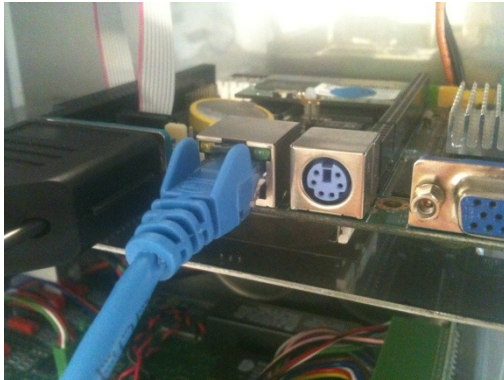
The Network cable position on the CE board

The Compac MX box needs to have the following plugs connected. All other connections are not needed when using the Compac MX Box.