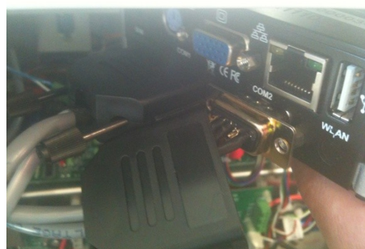
The Cardreader Cable position on the Compac MX box Note the cover may have to be removed to get the plug in (com 2)