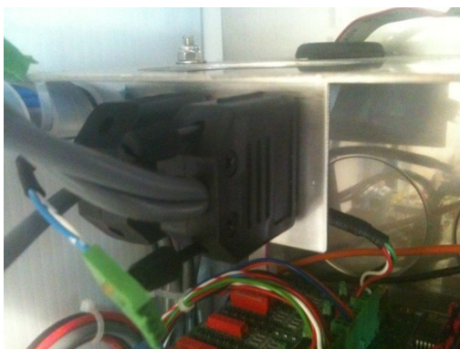
The Cardreader Cable position on the CE board