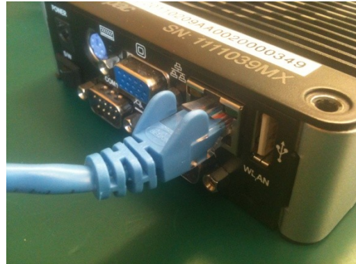
The Network cable position on the Compac MX box