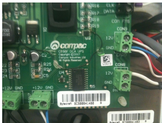
The Compac MX box can be wired into any spare 12 volt connector. The picture above shows it connected to CON8

After the 5 volt power cable has been removed the 12 volt Compac MX Box cable can be installed. This is to be installed into the 12 volt DC supply terminals on the UPS board. The leads on the Compac MX box power jack will be labelled "12 volts" ( White wire) and "GND" ( Black wire).