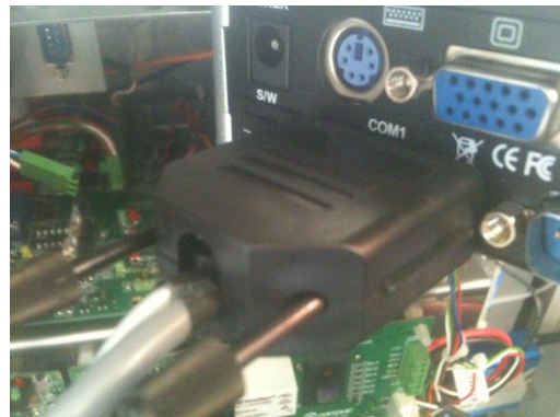
The Pinpad Cable position on the Compac MX box (com 1)