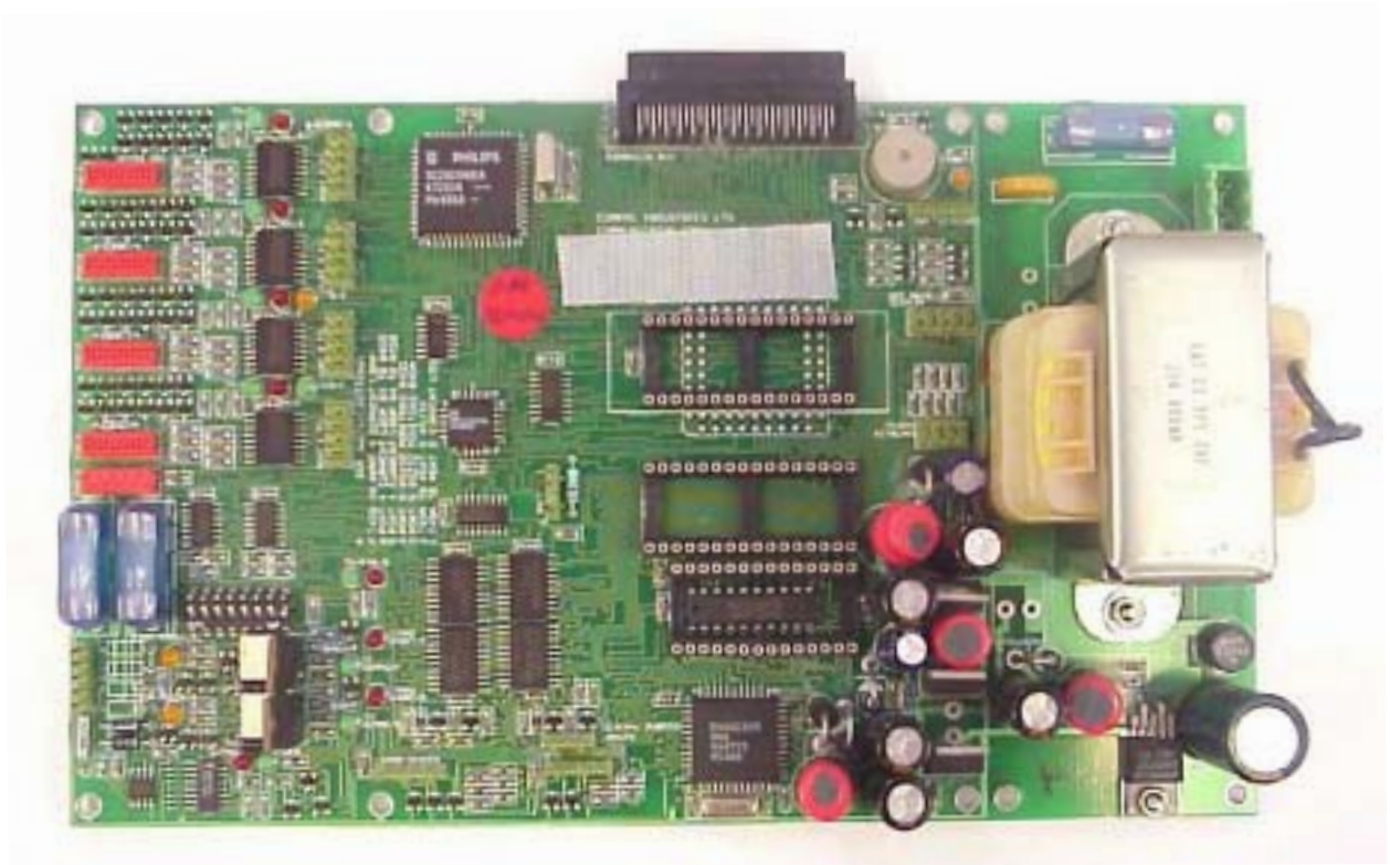
Compac Communicator Controller Circuit Board