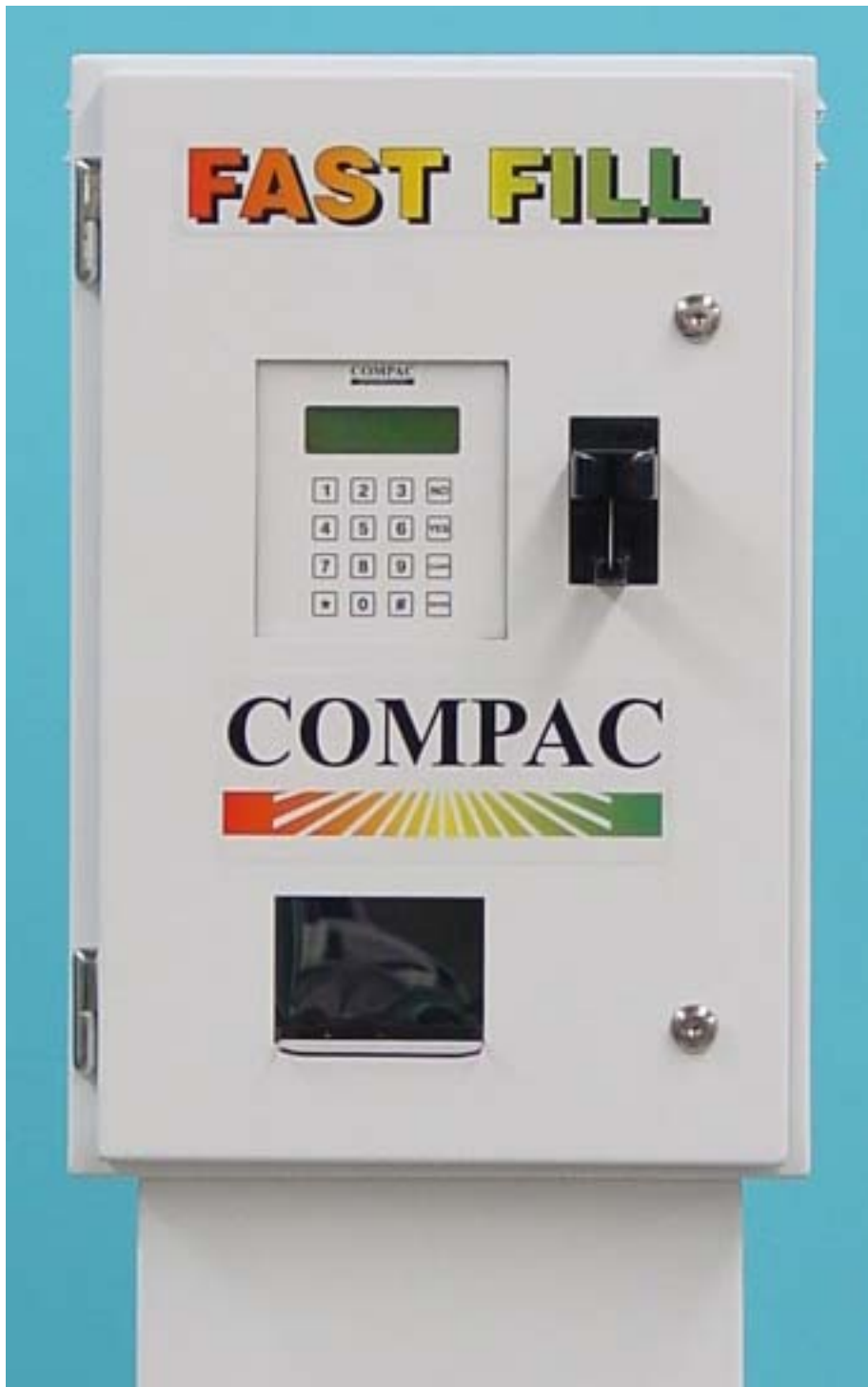
Compac model DCA/RAS Card-Operated Terminal